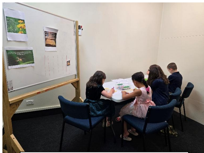
Children's Jr. Church