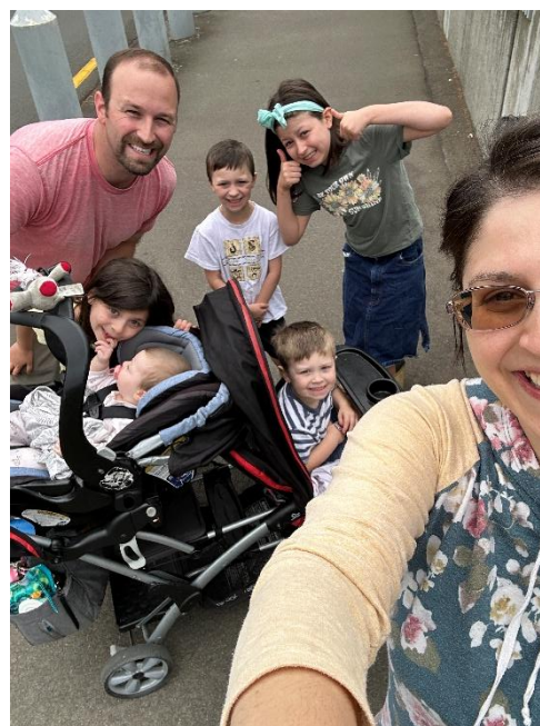
Getting Passports renewed at the U.S. Embassy