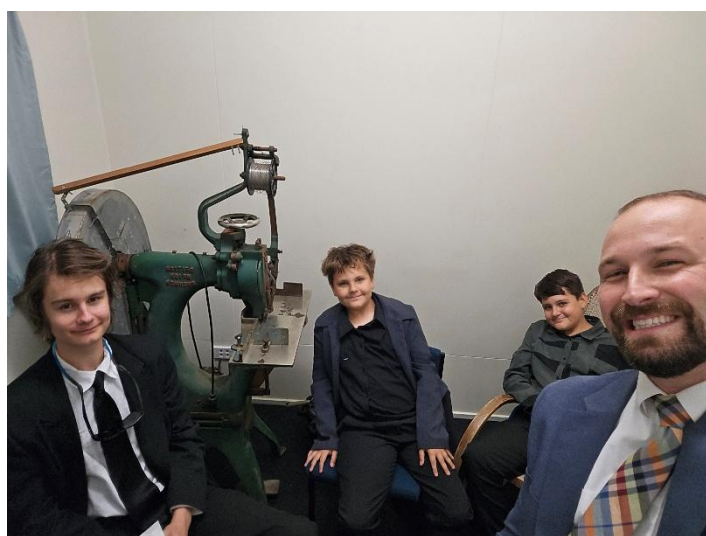
Teen Sunday School Class