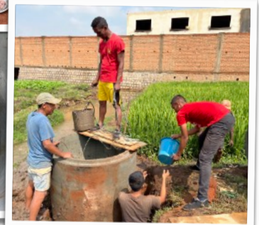
digging a well