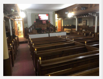
Chapel prepared for our regular Christmas Eve Carol Service.

...Teaching them to observe all things whatsoever I have commanded you: and, Io, I am with you alway, even unto the end of the world. Amen.