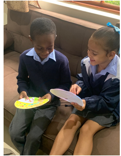
Two of my students telling each other the Easter story using one of the art projects from this week!