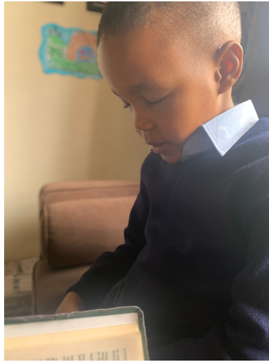
So very thankful that one of my students placed his trust in Christ this past week! God is good!