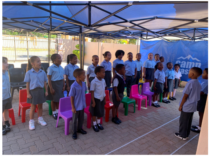
We practiced for hours and hours to learn our end of year program.