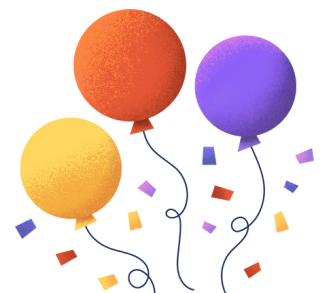
All ready to celebrate the end of year!