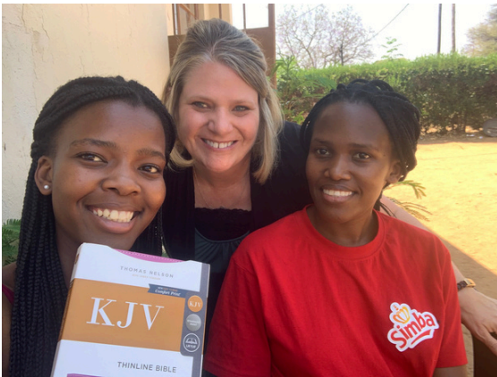
What a blessing to work through discipleship with these ladies. They came to church and were saved as a result of a praying sister. There is power in prayer!