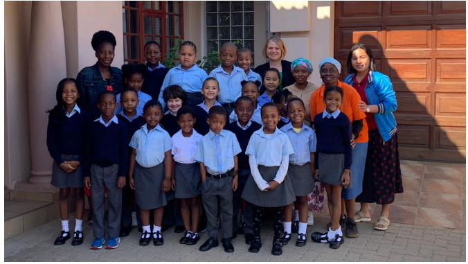
We had everyone at school the day before elections— that was cause for a group picture! Thankful for the ladies pictured who daily helped me at GLC.