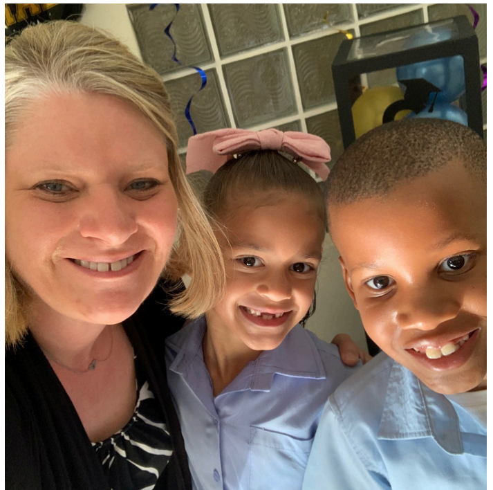
The girl was my first tutoring student when she was just 3! The boy was my first student at GLC!