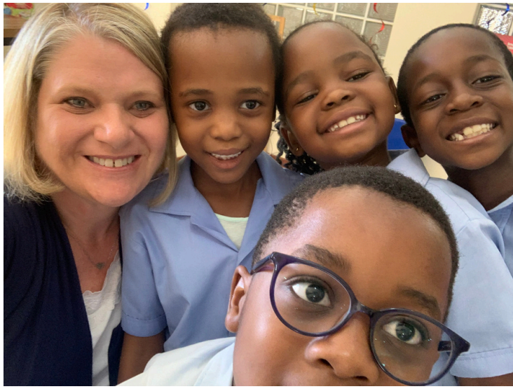
Even a little child can understand salvation- the girl beside me and the boy in front of me received assurance of their salvation. The girl and boy on the right were saved! Wonderful way to close out my ministry at GLC!