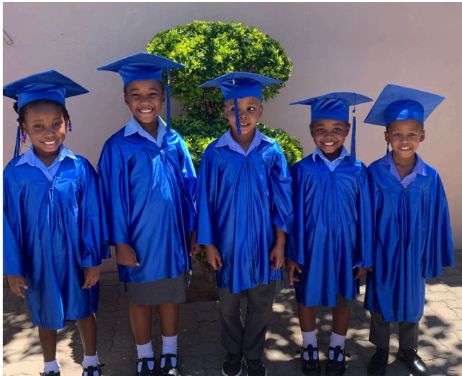
2024 Kindergarten graduates