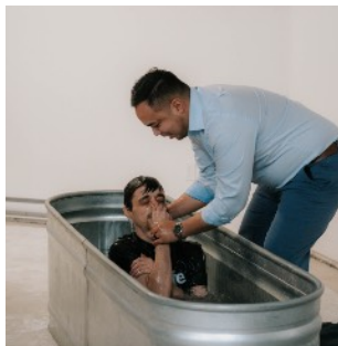
Our first baptism Sunday