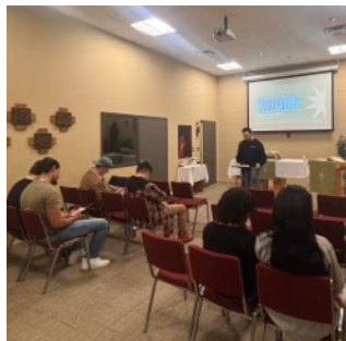
SMU Campus Ministry